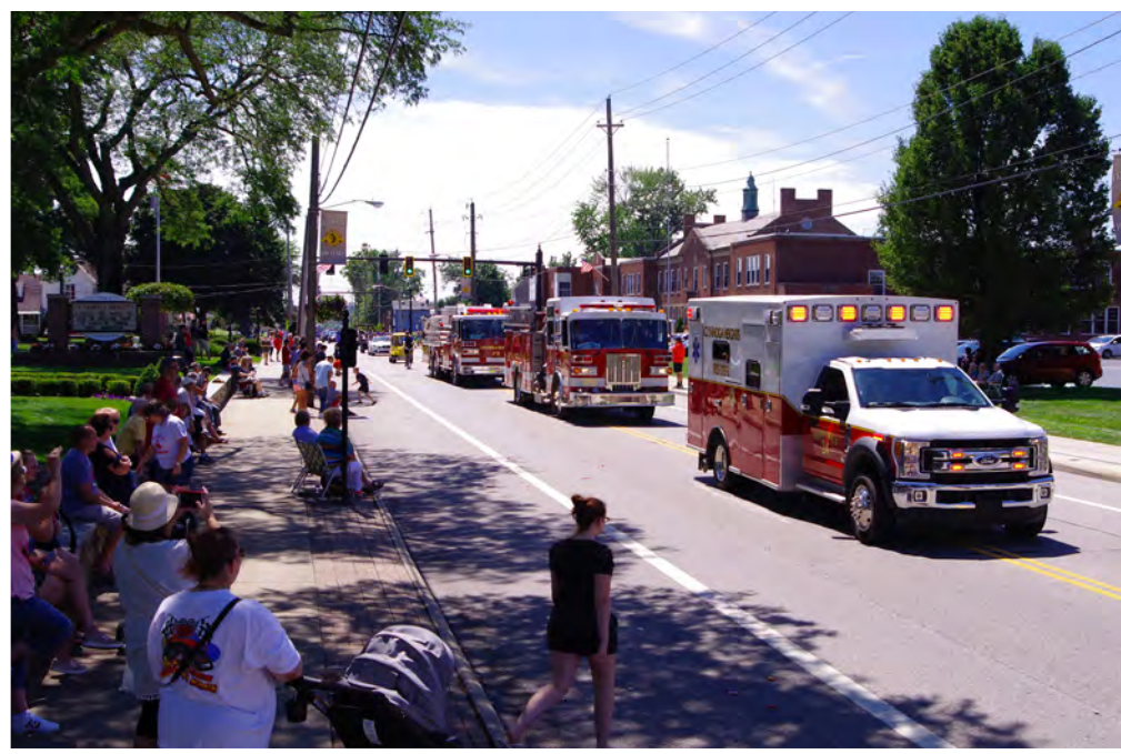
August 11, 2018 Centennial Parade