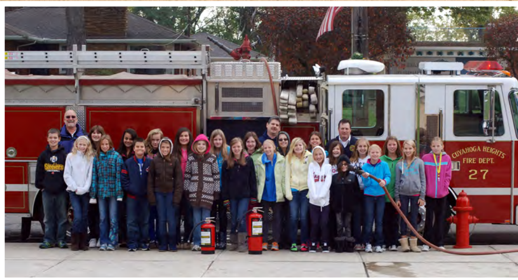
Safety demonstration at Cuyahoga Heights School