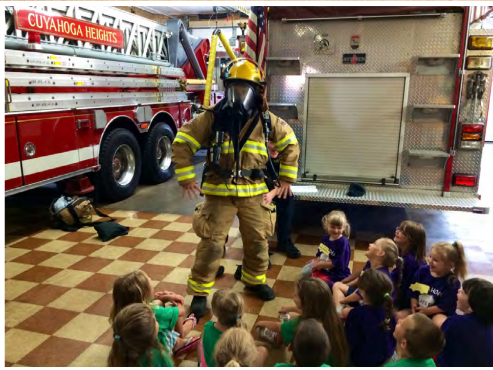
Safety Town fun in the firehouse