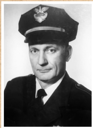
Donald J. Boing United States Far East Air Force