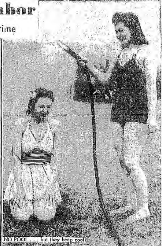
NO POOL . . . but they keep cool