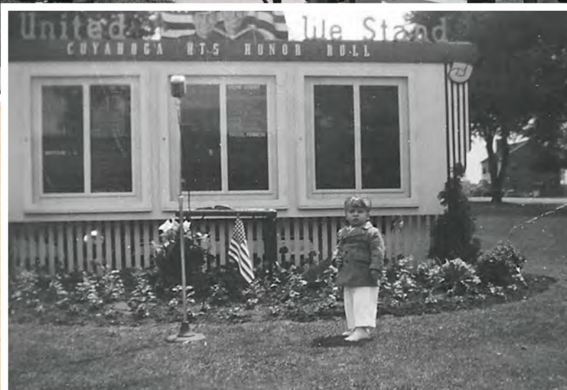
Memorial Day and early Honor Roll sign board