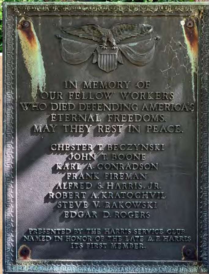
Harris Service Club (Harris-Seybold) World War II Memorial at 4510 East 71st Street