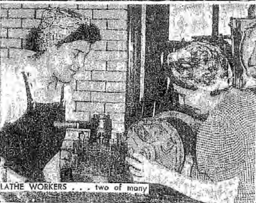
LATHE WORKERS . . . two of many