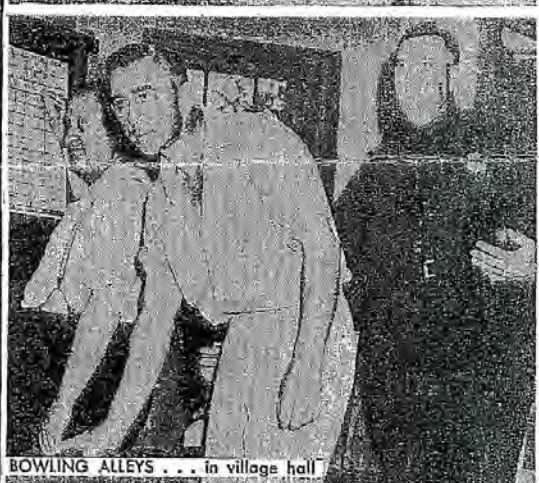
BOWLING ALLEYS . . . in village hall

from nearby plants. While they train, these workers are producing war materials on a subcontract basis.