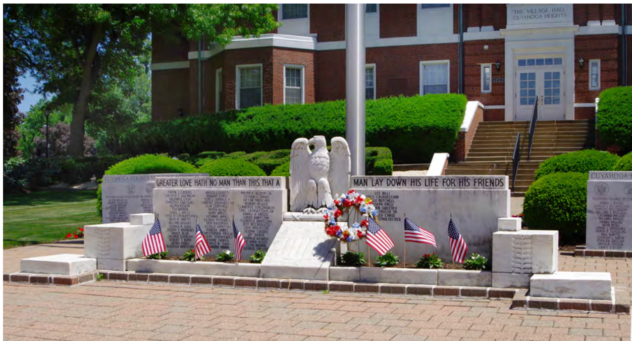
Village Hall Memorial

The marble memorial at the village hall was dedicated in 1948 in tribute to all resident men and women who served in the military. It is the scene of our annual Memorial Day Service.