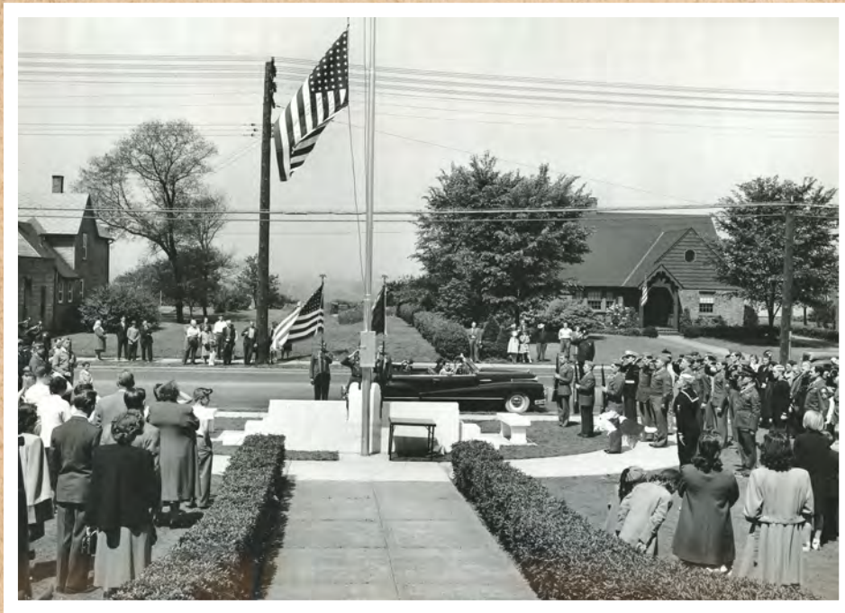
Memorial Day Ceremony at Village Hall