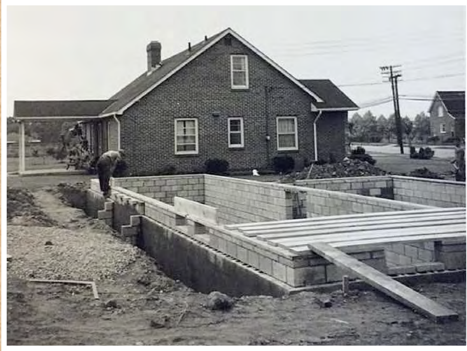
4703 East 71st Street construction in 1960