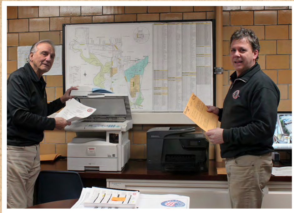
Building department office in village hall