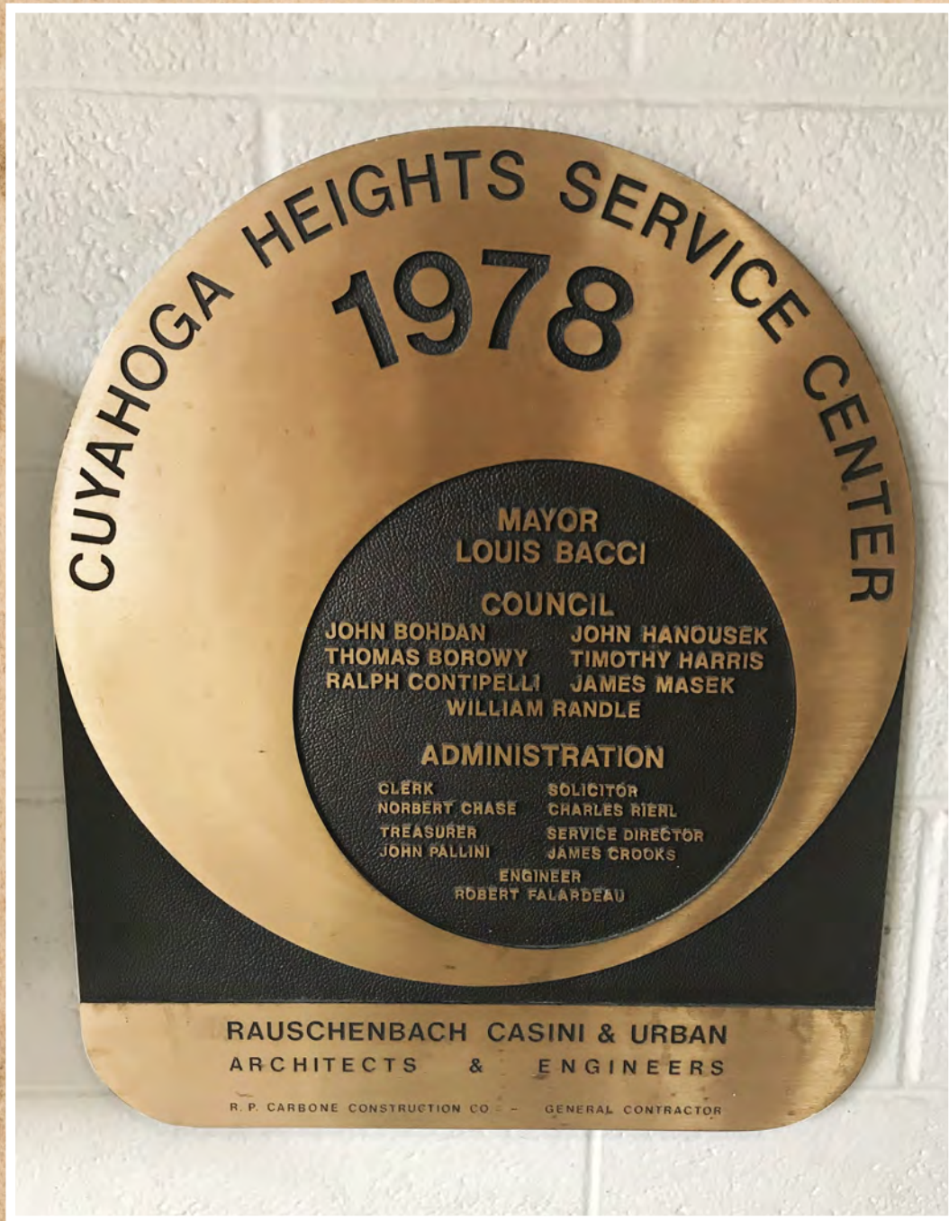
Cuyahoga Heights Service Center plaque