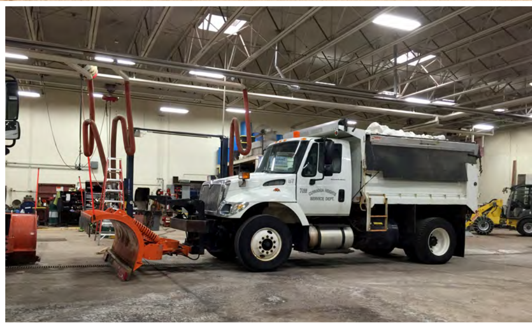
Service department vehicle storage and maintenance garage