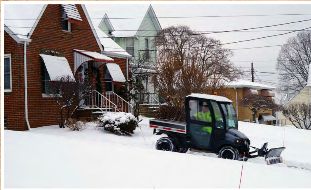
Plowing driveways and sidewalks on East 71st Street