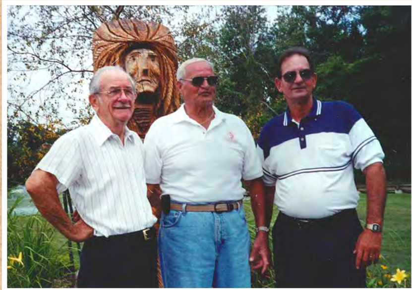
Service department crew and “village dignitaries” in front of an old wood carving in Bacci Park