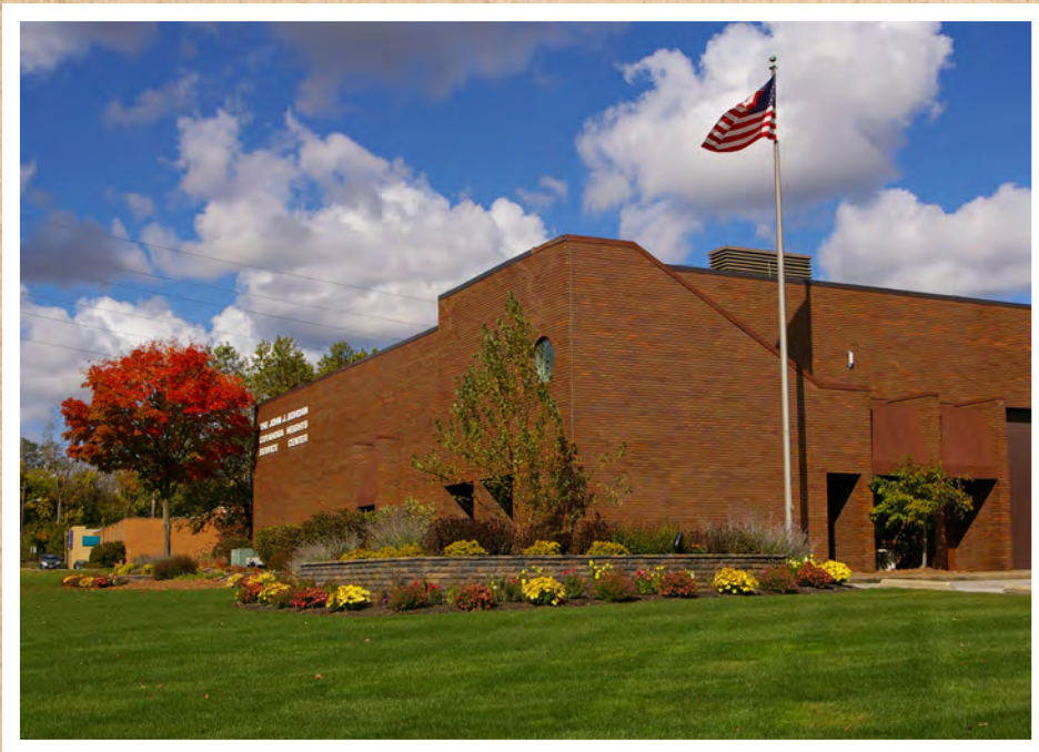
John J. Bohdan Service Center 7201 Canal Road