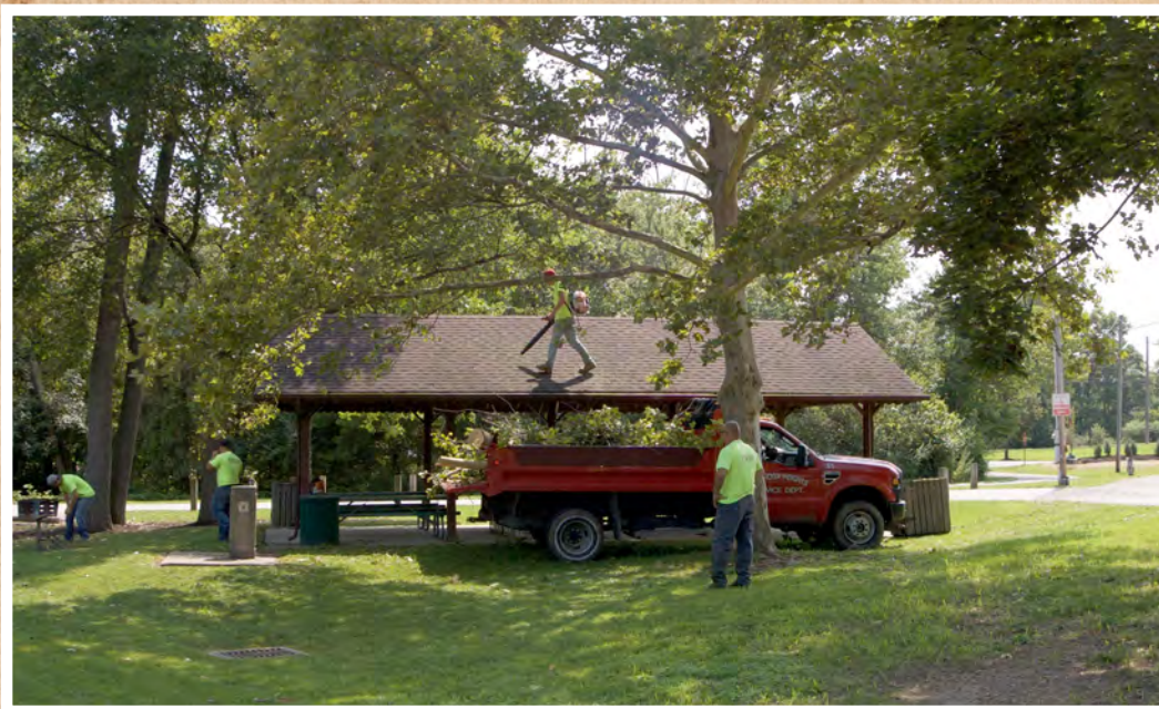
Watering flower baskets at village hall and spring cleanup at Bacci Park