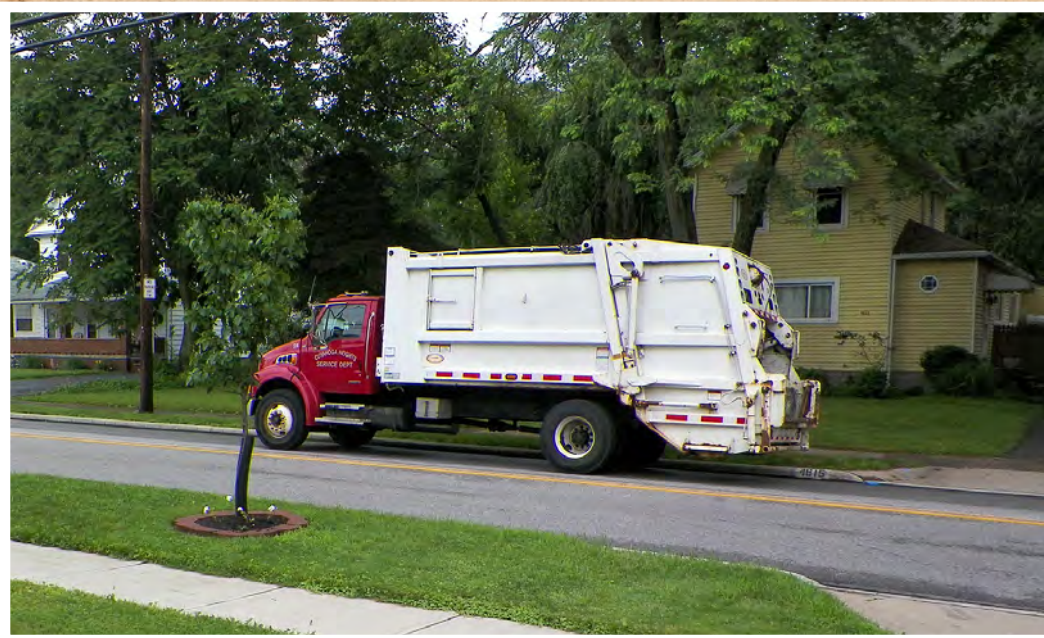
Lawn mowing and trash pickup on East 49th Street