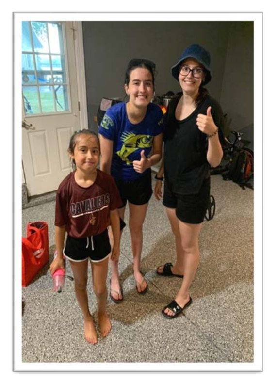
Making memories and getting caught in a pop-up downpour while riding in a golf cart.