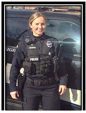
The Rookies' 1st Day