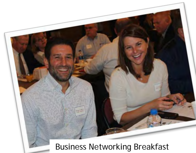
Business Networking Breakfast