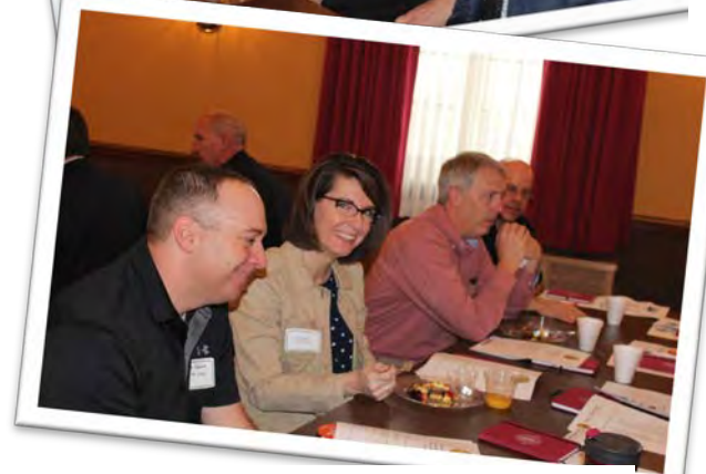
Business Networking Breakfast