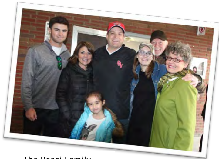
The Bacci Family