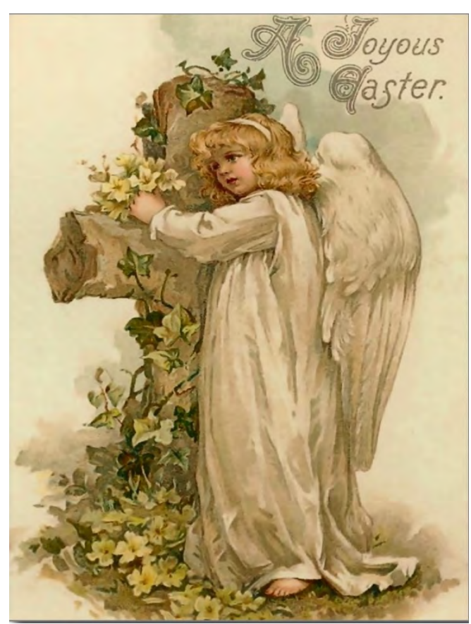
Old Easter Postcard