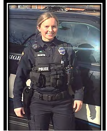
The Rookies' 1st Day