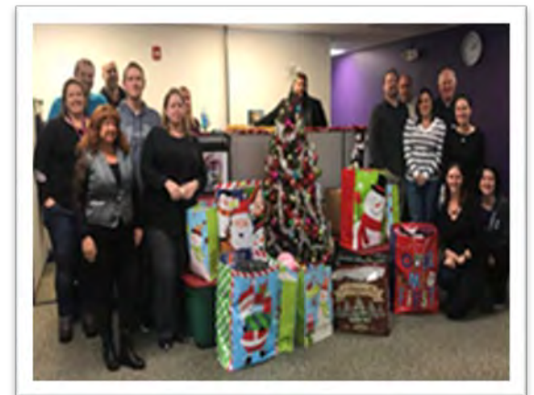
Employees from MilliporeSigma with their gifts they provided to two of the families.