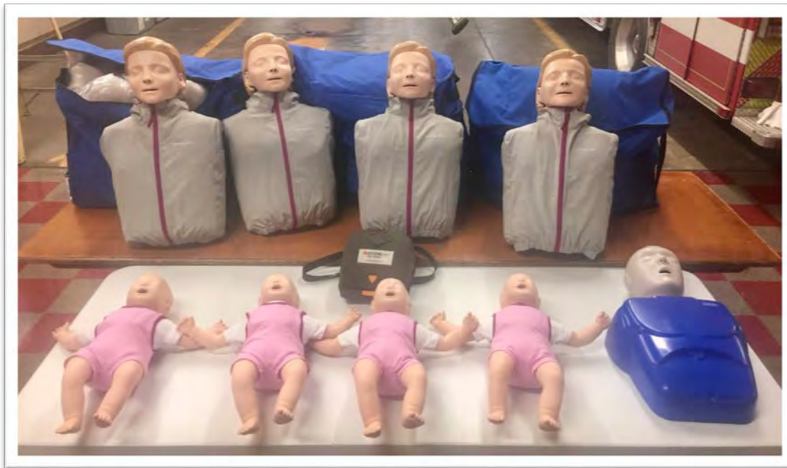
Training equipment courtesy of ArcelorMittal.