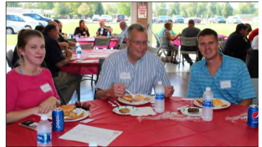
Compliance Technologies and Brooklyn Machine