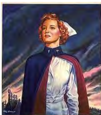
NURSES ARE Needed Now!