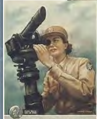
WOMAN'S PLACE IN WAR The Army of the United States has 239 kinds of jobs for women THE WOMEN'S ARMY CORPS