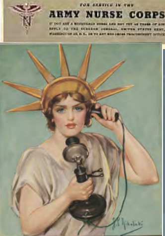
HELLO! THIS IS LIBERTY SPEAKING BILLIONS OF DOLLARS ARE NEEDED AND NEEDED NOW