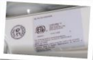
Label of a recognized testing laboratory

Only 2 percent of heating fires in homes involved portable heaters; however, portable heaters were involved in 45 percent of all fatal heating fires in homes.