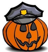
HALLOWEEN SAFETY TIPS

Please take a look at the Halloween safety tip sheet (National Safety Council) that is included with this newsletter.