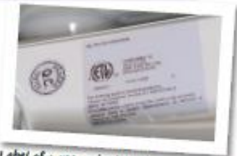
Label of a recognized testing laboratory

Only 2 percent of heating fires in homes involved portable heaters; however, portable heaters were involved in 45 percent of all fatal heating fires in homes.